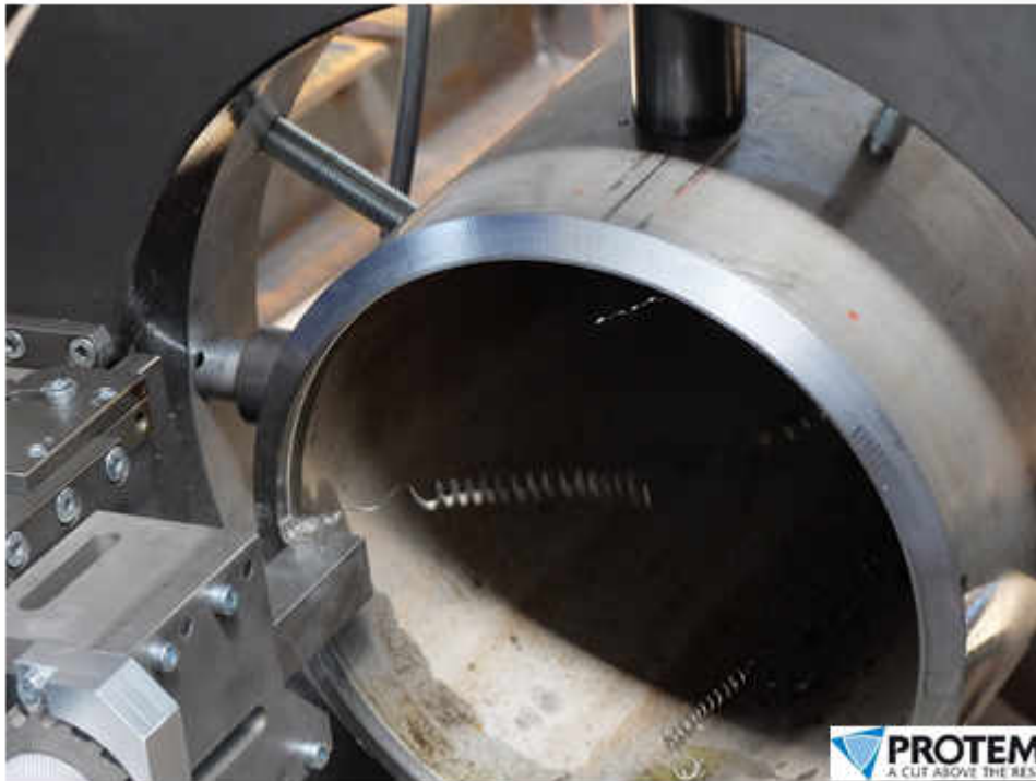
3. Machining the inside of a P91 pipe with a PROTEM TT series beveling machine