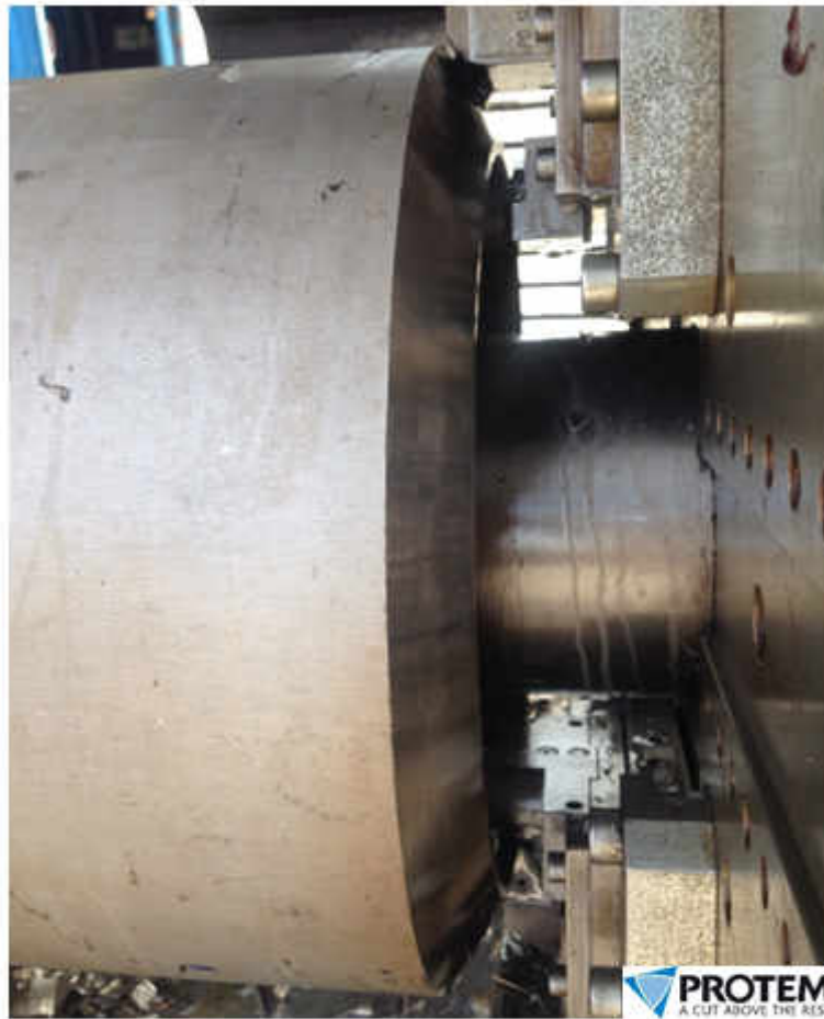
4. Machining a Duplex pipe at an angle of 30° with a PROTEM US 150 beveling machine