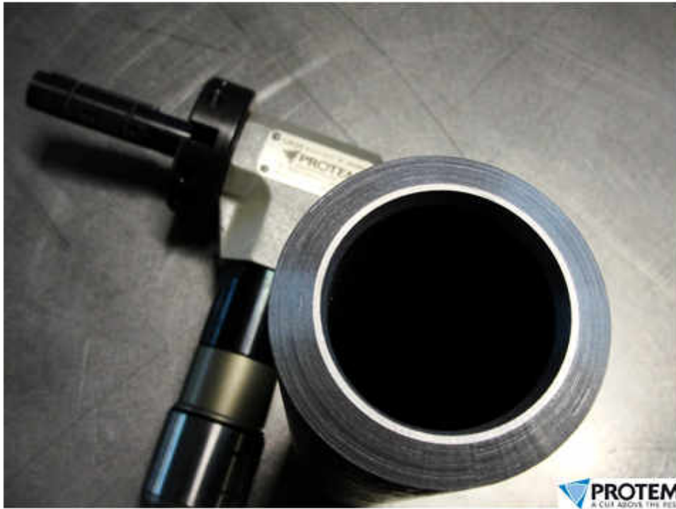
2. Machining a pipe at an angle of 30° with a PROTEM US 25 beveling machine

Low-alloy steel (i.e., with a low carbon level between 0.008% and 2.14%) can be easily machined. When the carbon rate increases, the material properties (such as hardness or mechanical resistance) tend to improve significantly. However, machining steels with a high carbon level is more difficult.