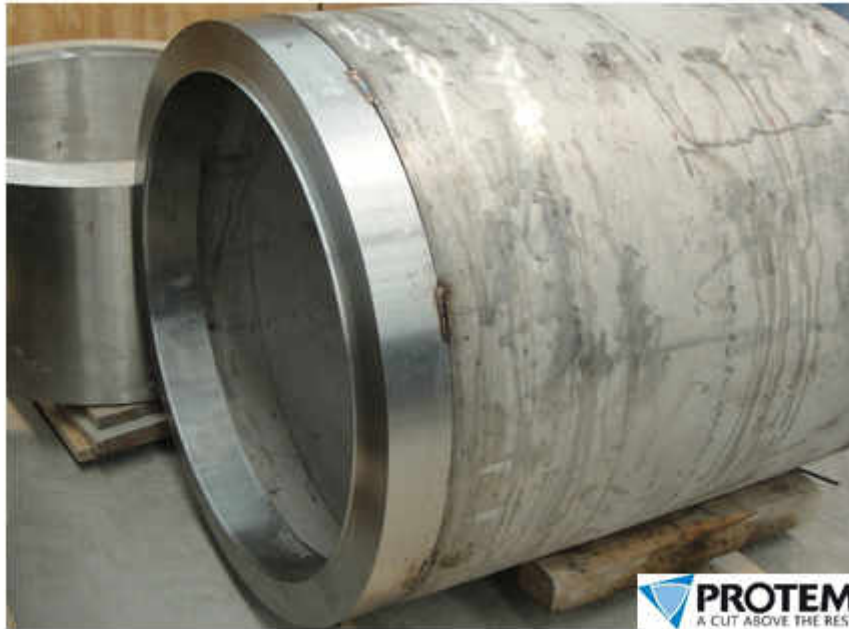
6. Machining with superalloys, PROTEM TTNG 1016 Orbital Tube Cutting & Beveling machine