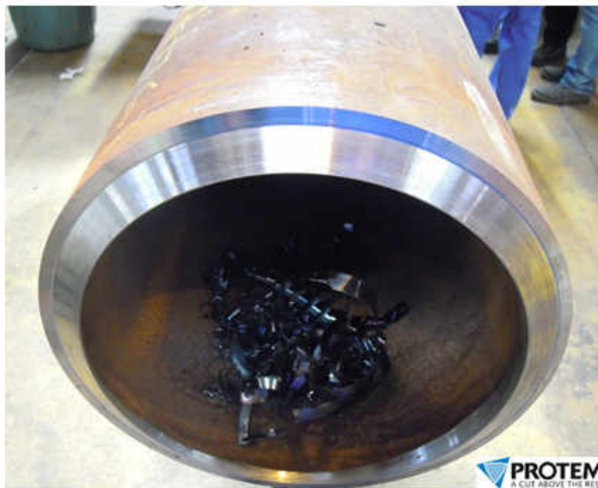
1. Machining a thick pipe prior to welding with a PROTEM US 150HSB beveling machine

Machining is a common operation when preparing a piece for welding. The pipe end has to be machined at specific angles so that the weld can penetrate the entire thickness of the pipe material.