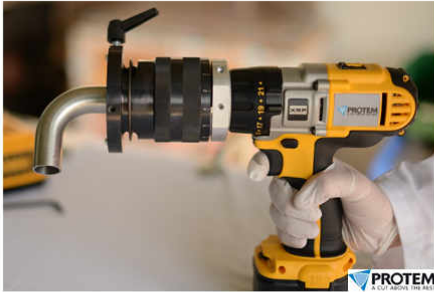
7. Titanium-elbow machining for the Aeronautics sector, PROTEM SE 2T pipe-squaring machine